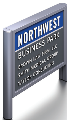
RADIUS POST & PANEL