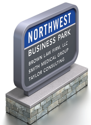
RADIUS CORNER FRAME / BASE MOUNT ON STONE