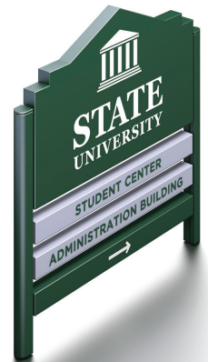
CUSTOM SHAPED HEADER / EXTENDED 325 RADIUS POSTS / WORD BARS